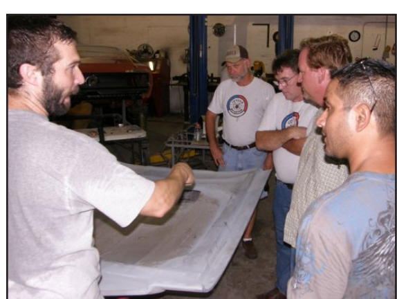
Tour of Classic Cars of Houston