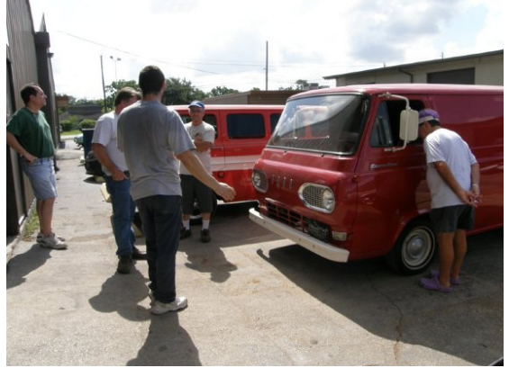
Tour of Classic Cars of Houston